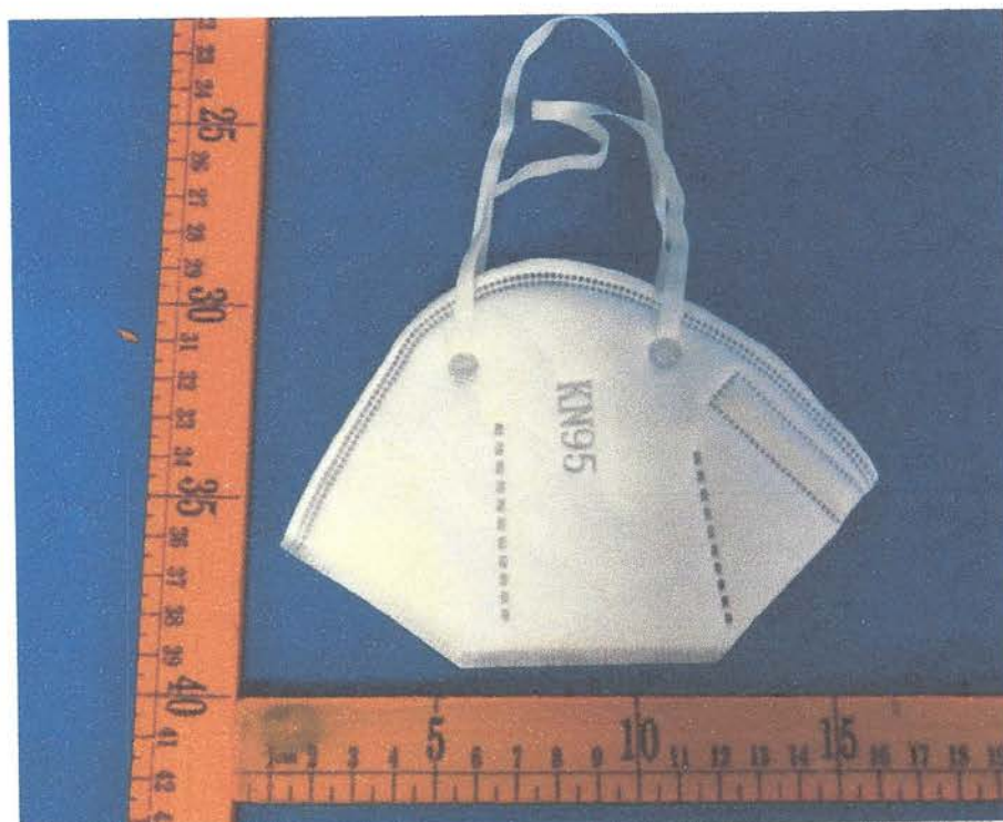
General view for SD-KN95-01