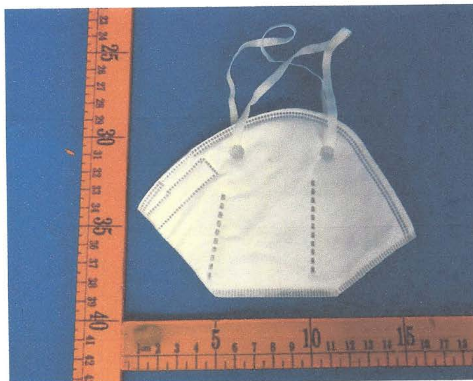
General view for SD-KN95-01